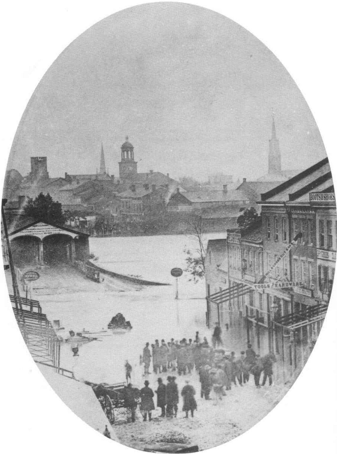
This was the scene Sept. 20, 1866, before the flooded Great Miami River swept away the Miami Bridge, a two-lane wooden structure opened in 1819. This view is from Rossville. See Pages 19-22 for more details.