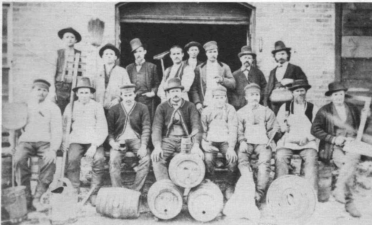
Management and employees, West Hamilton Brewery, about 1876

Its People, Ghosts, Places, Bridges & Businesses